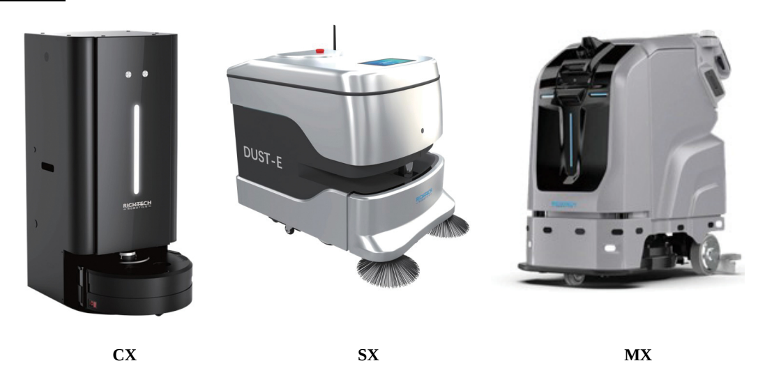
DUST-E is our autonomous commercial cleaning robot product line that features three distinct models, the CX, SX and MX.

The CX is our smallest robot designed to perform routine vacuum and mopping in spaces less than 10,000 sq. ft. The CX is tailored to indoor hard floor office environments. The system incorporates a base station tower that charges the robot, automatically exchanges dirty water for clean water, and empties the dust bin for maximum coverage and convenience. The CX, as with all robots in this line, has a pressurized mop and comes with optional UV disinfection.