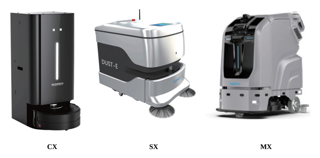
{\it DUST-E} is our autonomous commercial cleaning robot product line that features three distinct models, the CX, SX and MX.

The CX is our smallest robot designed to perform routine vacuum and mopping in spaces less than 10,000 sq. ft. The CX is tailored to indoor hard floor office environments. The system incorporates a base station tower that charges the robot, automatically exchanges dirty water for clean water, and empties the dust bin for maximum coverage and convenience. The CX, as with all robots in this line, has a pressurized mop and comes with optional UV disinfection.